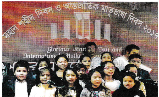
Bangladesh Embassy in Athens