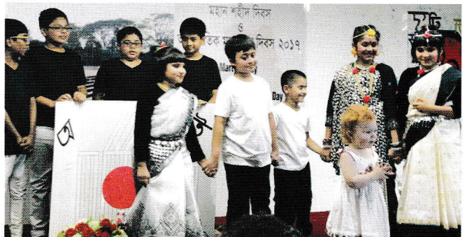
Bangladesh Consulate General in New York

minute's silence to pay homage to the martyrs. Messages from President, Prime Minister, Foreign Minister and State Minister for Foreign Affairs were read out at the beginning of the discussion. Apart from the Heads of Missions, a number of eminent Bangladeshis delivered speeches expressing their emotions and thoughts on the occasion highlighting the significance of the day.